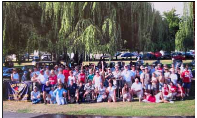
The '108' Club...On July 27, 2009 we opened the Cruisin' even though it was 108 degrees. We had 63 people, 37 hot rods, and 1 bike. That was the last time we opened the show once it hit 100! Whew!

The Cruisin' season has begun... every Wednesday night from 4:00pm-Dusk at Portland International Raceway. It has truly been fun to do this show for 29 years. We look forward to an amazing summer with all our friends bringing in those cool rides. Show participants can still arrive at 3:00pm and get in early. Besides the cars, bikes & drag racing, enjoy the food carts, bar, kid's activity, great local bands, and just a relaxing evening with friends. And, you help us raise money for those in need just by showing up. See ya soon!