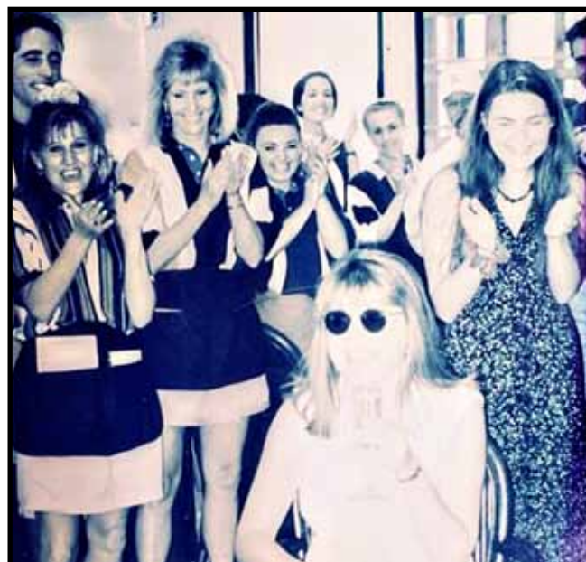
This photo has been hanging on the wall of the Beaches Bar for 29 years!