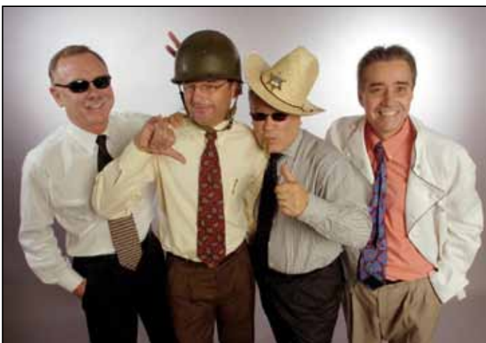
The King of Ink & friends. Yes, we let them hang out at the Beach!