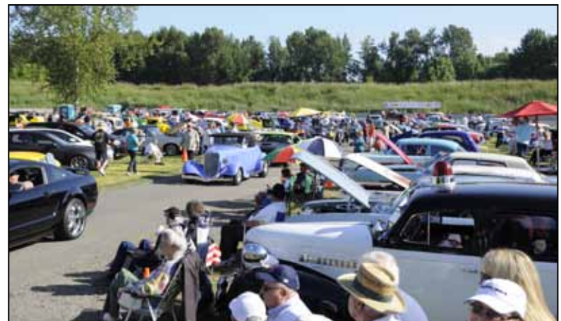
The cars will be rolling for a big 2024 season!