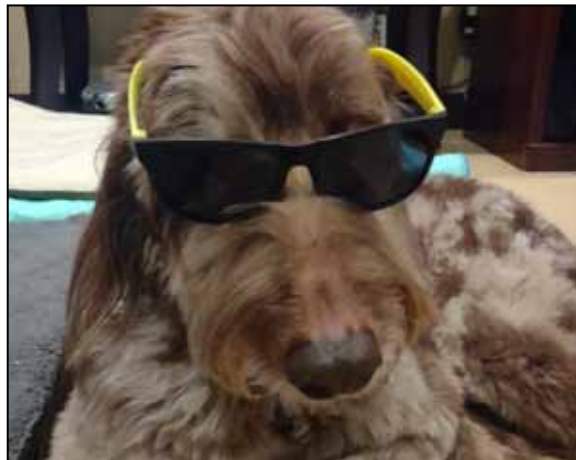
Coco hangin' out at the Beach!