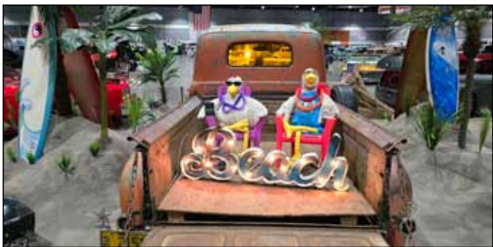
Who's that in the back of Eugene's Truck?