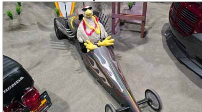
Ready for a quick getaway from the chef!