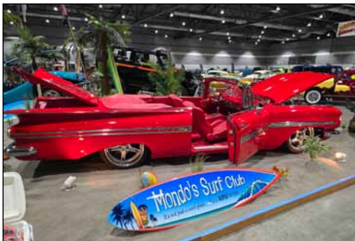
Tom File's '59....Show Winner!

Our last Portland Roadster Show... went out Big with a 110x30 display, 31 yards of sand, 24 palm trees, 9 cars, 4 bikes, 4 chickens and a lot of fun!